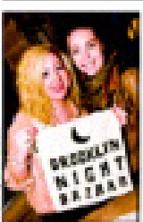
Visitors at Brooklyn Night Market in Williamsburg.

The MTA is planning two new bus routes in Williamsburg. The routes are set to run in September. The routes are set to run in September. The routes are set to run in September.